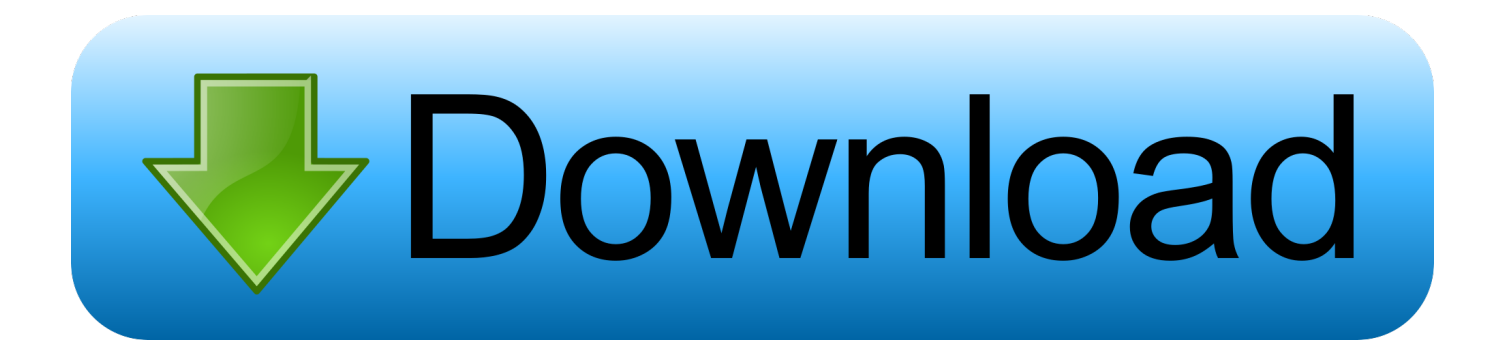
ITools 4.4.3.6 Full Crack With Activation Key Free Download 2019